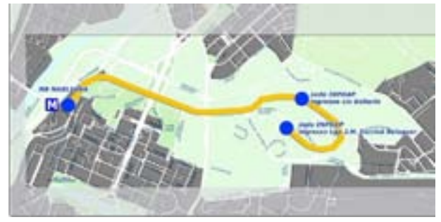
Project of shuttle cofunded by the Municipality of Rome

The establishment of a home to office Commuting Plan is also one of the Mobility Managers' main tasks. The mobility of employees is first surveyed trough questionnaires asking information about both their present commuting mode of transport used, and their availability to adopt more intelligent commuting habits if a number of measures/tools/incentives are made available. A commuting plan is then drafted, including notably the company's best practices and fostering the use of public transport or its integration with the private car. Appointed Mobility Managers often lack some of the specific technical skills needed for their role, and are therefore guided by a public figure appointed in their region: the Area Mobility Manager. Area Mobility Managers assist all the Mobility Managers and Companies with advisory activities and technical support. The Interaction between Area Mobility Managers and Mobility Managers include: