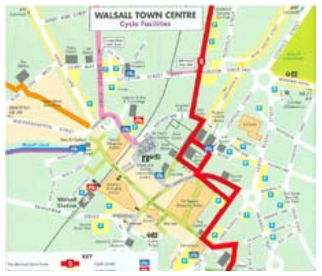
Example of a map for Cyclists to plan a safe route to work (NBTN)

four of the UK workforce. This is a business-to-business network which enables companies to share best practice and promote the rationale for travel plans. Through research and practical case studies, NBTN is developing and demonstrating the strong business case for workplace travel planning. It organises regular meetings to explore relevant issues in travel planning and has developed free information and guidance for employers on topics including tax and travel plans, motorcycling, cycling, walking. They have also developed practical tools to develop personalised access maps for site location and access for pedestrians and cyclists. This is part of the Cycle to Work Guarantee website<sup>15</sup>.