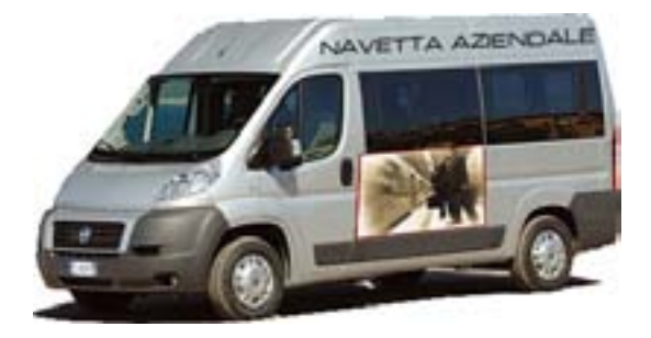
Company Shuttle (Roma Servizi per la Mobilità)

public administrations (Municipalities/the Ministry of Environment) have set up a scheme to allocate funds and provide support to companies cofunding services of company shuttles. Companies with a Mobility Manager (see section below on national initiatives, the experience of Rome) can submit applications for the cofunding of shuttles: this includes the reimbursement of up to 50% of the total costs of management for a period of two/three years. There is also the possibility for a group of employers located in the same area to submit a project to obtain co-funding for a shared service.